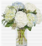
SHADED CUTTING GARDEN